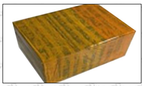
Pic No.3 International express packaging: Wrapped with yellow tape after wrapping black protective film

Mob/Whatsapp: +86 13410541523 Tel: +8675523215133 Email: ruby@shumatt.com